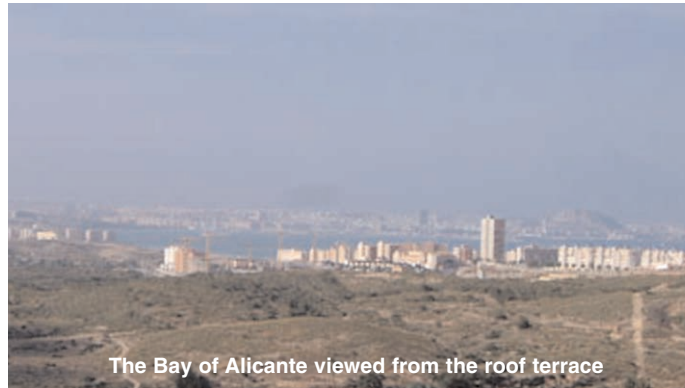
The Bay of Alicante viewed from the roof terrace

The double bedroom has a door leading to a small balcony and the second flight of stairs leads to a very large solarium which has all-round beautiful views over Alicante Bay and a ravine. It has patio table, chairs and a barbeque. The property is fitted with traditional Spanish security grilles to ensure a safe and stress-free holiday. Rental price range: £200-£350 p/w inclusive